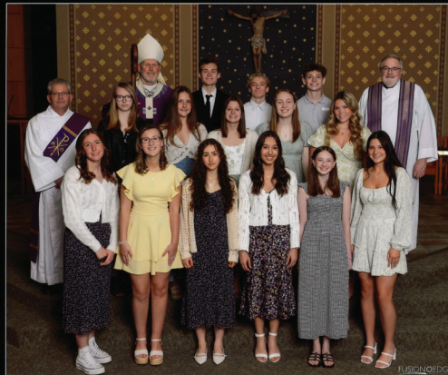
ALL SAINTS CONFIRMATION 2025

May God bless you as you continue to Love God-Serve Others-Form Disciples.