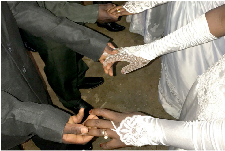
The pastor of our sister parish cannot be in two places at once. With over 15 chapels in villages disbursed among the rugged mountains of the Ouest State of Haiti, he is not able to visit them often. He must perform multiple marriage sacraments during one visit.