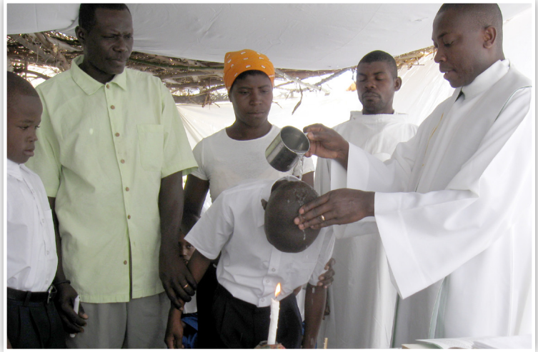
A young boy is baptized in one of the many chapels of our sister parish.

Please continue to support our sister parish with prayer and financial contributions.