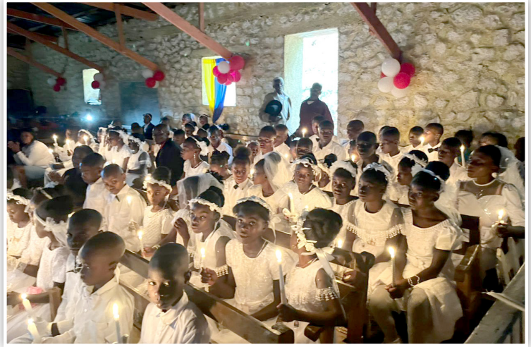
A beautiful candlelit first communion service takes place at the chapel in the village of Barassa, one of the communities that makes up our sister parish of Notre Dame de Lourdes. Much like the children at our parish, communicants look forward to dressing their best for this sacred celebration.